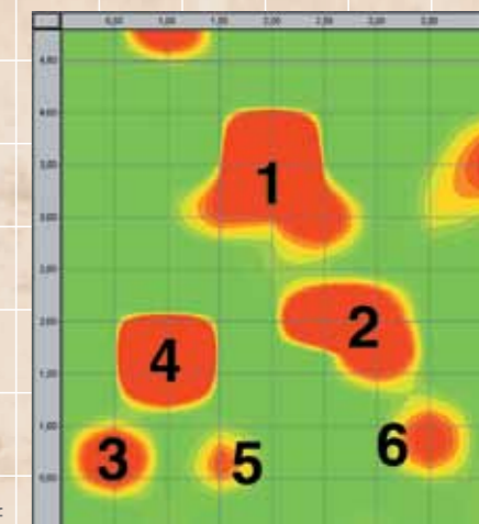
60 cm search head (Option UXO): 1 = 50 kg aerial bomb at 1.7 m depth 2 = 75 mm tank grenade at 1.2 m depth

By using the 60-cm-UXO-search head great detection depths are achieved.