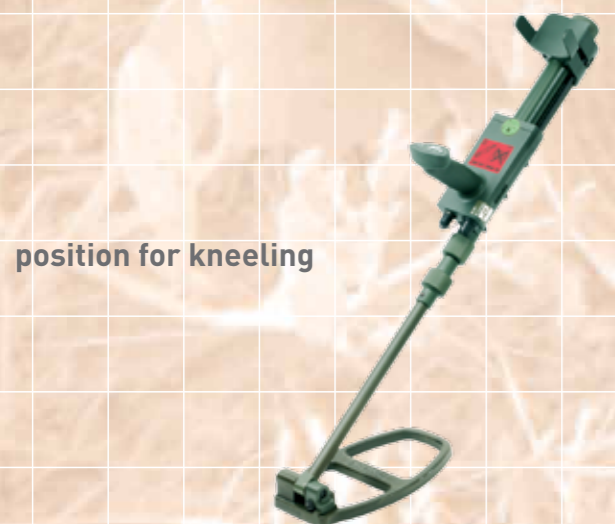
position for kneeling