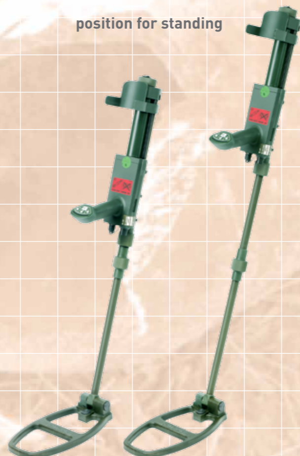
position for standing

The inner and outer tube of the telescopic pole are protected against twisting. The length of the telescopic pole can be adjusted from 920 mm to 1260 mm in just a few seconds.