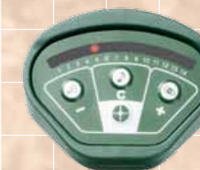
aluminium cylinder 50 mm length 16 mm dia.