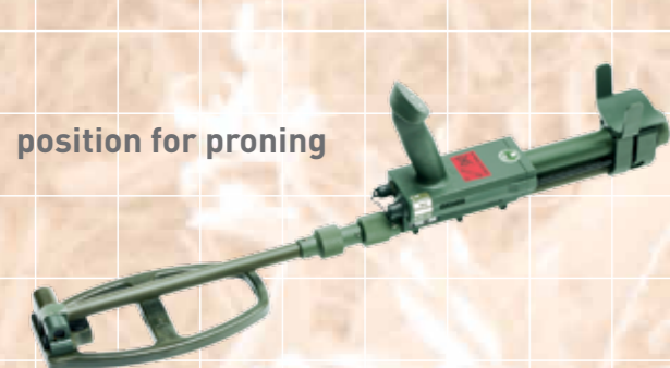
position for proning