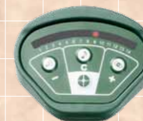
submunition BLU 60 mm dia.

In program "metal discrimination" the deflection to the right or to the left indicates ferrous or non-ferrous metals, for example: