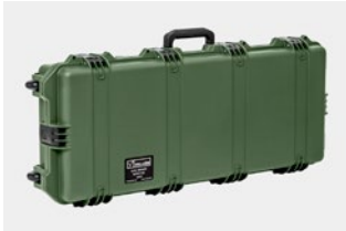
Case VMR3 Item No. 2902830064