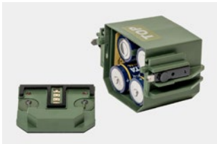
Battery compartment VBH3 Item No. 2902830080