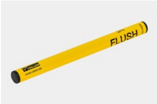
Test piece "GPR-Flush" Item No. 2902440095