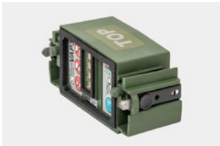
Rechargeable battery block VAP3 Ambient temperature: -31°C – +63°C Storage temperature: -20°C – +35°C* Item No. 2902830035