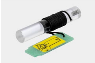
Test piece with adjustment plate for brake screw Item No. 2909990733