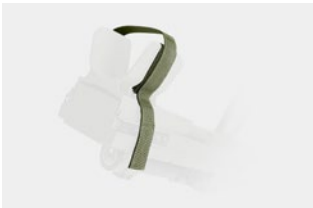
Arm strap Item No. 8909990832