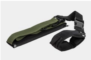
Shoulder straps with pads VMR2/ VMR3/VR1 Item No. 2902440123