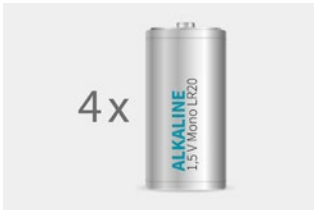
Alkaline battery 1.5 V Mono LR20, 4 ea. Item No. 5910001006S4