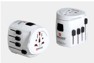
Universal power plug adapter Item No. 9150006102