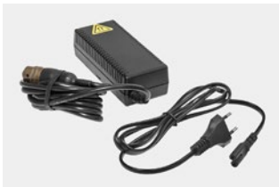
Power adapter for battery charger VAP3 Item No. 2902440126