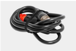
Charging cable for 12V/24V vehicle plug socket Item No. 2502440006