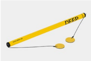
Test piece "GPR-Deep" Item No. 2902440094