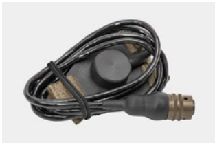
Headphone VMR3/VMR3G/VR1 Item No. 2902440026