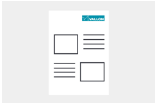
Field manual VMR3 Item No. 8902830072