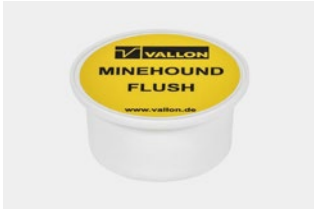
Test piece "Minehound-Flush" Item No. 2902440075