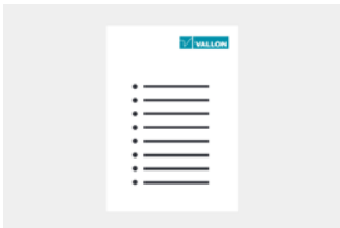
Operation manual VMR3 Item No. 8902830071