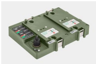
Battery charger VAP3 Item No. 2902830018