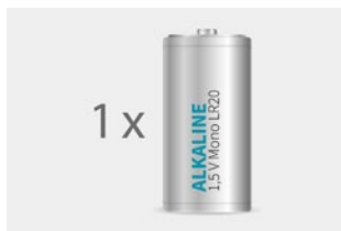
Alkaline battery 1.5 V Mono LR20 Item No. 5910001006