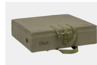
Universal case UXO search coil large Item No. 2802530001