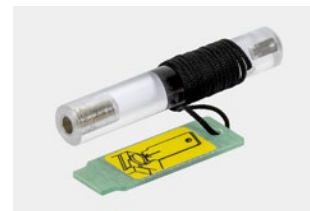
Test piece "non-ferrous" Item No. 2902530018