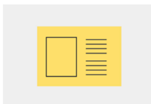
Backpack packing sketch VMXC1-3 Item No. 2902530010