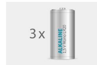
Alkaline battery 1.5 V Mono LR20, 3 e Item No. 5910001006S3