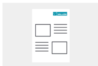
Field manual VMXC1-3 Item No. 2902530009