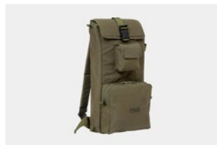
Backpack VMXC1-3 Item No. 8902530002