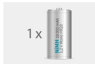
Rechargeable battery NiMH 1,2 V Mono HR20/10.000 mAh Item No. 5920001006