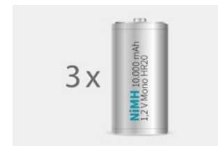
Rechargeable battery NiMH 1,2 V Mono HR20/10.000 mAh, 3 ea. Item No. 5920001006S3