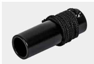
Test piece "ferrous" Item No. 2902530005