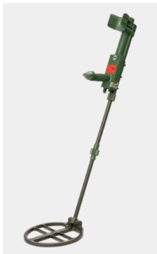
Metal Detector VMXC1-3