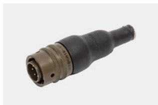
Headset adapter 6 Pole, 3rd generation Item No. 2909990751