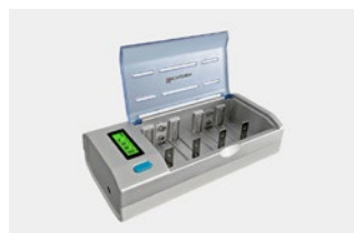
External battery charger 100-240V/50-60Hz, 12V Item No. 2909990847