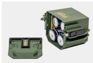
Battery compartment VBH3 Item No. 2902830080