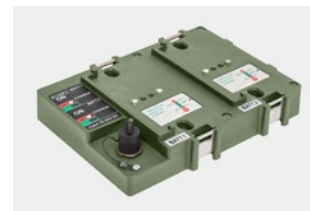
Battery charger VAP3 Item No. 2902830018