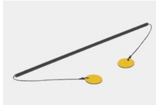
Test piece VR1 Item No. 2904130200