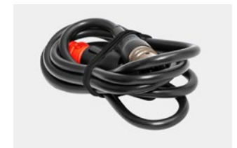
Charging cable for 12V/24V vehicle plug socket Item No. 2502440006