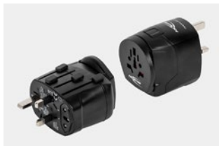
Universal power plug adapter Item No. 9150006102