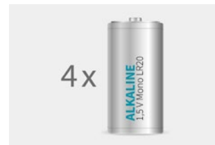
Alkaline battery 1.5 V Mono LR20, 4 ea. Item No. 5910001006S4