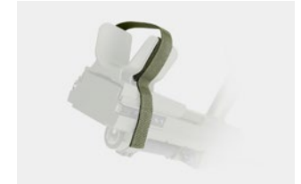
Arm strap Item No. 8909990832