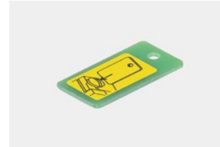
Plate brake screw Item No. 2909990723