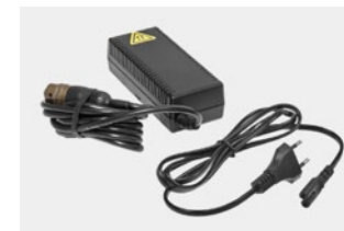
Power adapter for battery charger VAP3 Item No. 2902440126