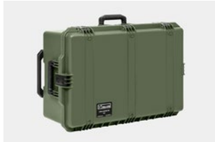
Case VR1 Item No. 2904130180