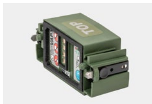
Rechargeable battery block VAP3, 2 ea. Item No. 2902830035