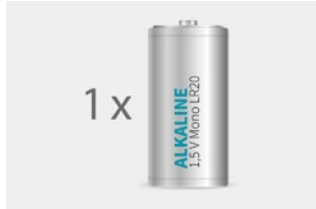
Alkaline battery 1.5 V Mono LR20 Item No. 5910001006