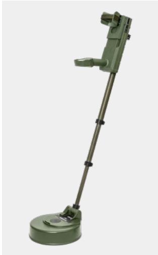
Cable Detector VR1