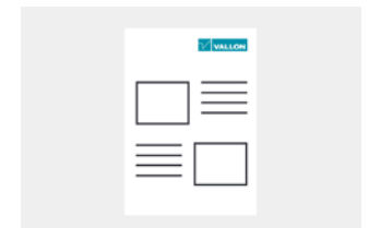
Field manual VR1 Item No. 8904130260