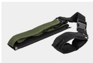
Shoulder straps with pads VMR2/ VMR3/VR1 Item No. 2902440123