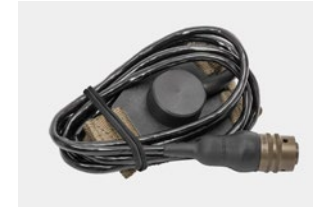
Headphone VMR3/VMR3G/VR1 Item No. 2902440026