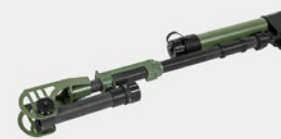
Carrying bar VX1 Item No. 2903170030