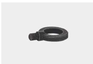
Ring screw Item No. 2909990105