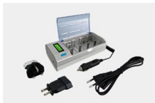
External battery charger 100-240V/50-60Hz, 12V Item No. 2909990847