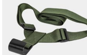
Carrying strap VX1 Item No. 8903170820