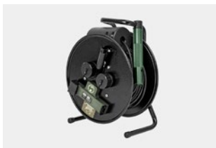
Cable drum VX1, 25 m Item No. 2903170260