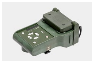
Control unit VX1 Item No. 2903170040