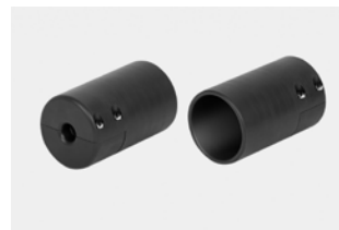
Borehole Shaft Guard Item No. 2900130170