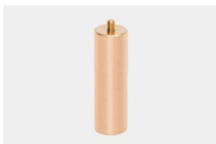
Extra weight Item No. 2909990631