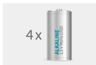
Alkaline battery 1.5 V Mono LR20, 4 ea. Item No. 5910001006S4