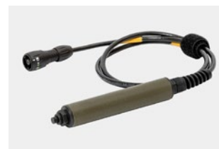
Hand switch start/stop VX1 Item No. 2503170160