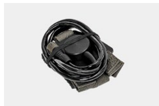
Headset VX1/VXT1 Item No. 2903170320