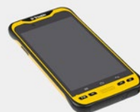
VFC4 – Small Field Computer for EVA4mobile® Item No. 2005350001