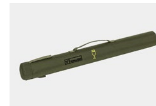
Transport bag for digital probe VSM4 Item No. 2903170450