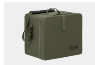
Carrying bag VX1 cable drum Item No. 2903170401