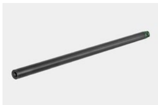
Digital probe VSM4 Item No. 2005320010