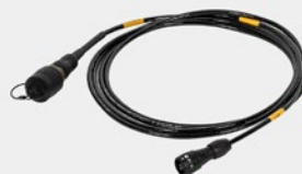
Connection cable SEPOS®-Borehole (VX1) Item No. 2503170040