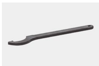
Hook wrench Item No. 9150006024