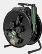
Cable drum VX1 SEPOS®, 15/12 m Item No. 2903170470