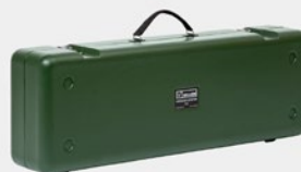
Case VX1 Item No. 2903170410