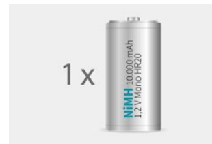
Rechargeable battery NiMH 1,2 V Mono HR20/10.000 mAh Item No. 5920001006