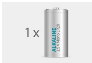
Alkaline battery 1.5 V Mono LR20 Item No. 5910001006