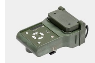
Control unit VX1 Item No. 2903170040