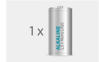
Alkaline battery 1.5 V Mono LR20 Item No. 5910001006