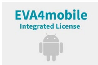
EVA4mobile® – Integrated license in combination with field computer VFC4 Item No. 2405350010