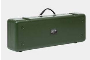
Case VX1 Item No. 2903170410