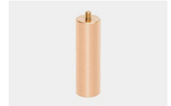
Extra weight Item No. 2909990631