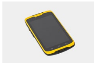
VFC4 – Small Field Computer for EVA4mobile® Item No. 2005350000