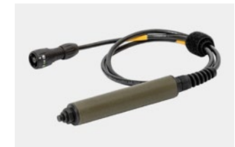
Hand switch start/stop VX1 Item No. 2503170160