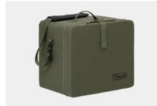
Carrying bag VX1 cable drum Item No. 2903170401