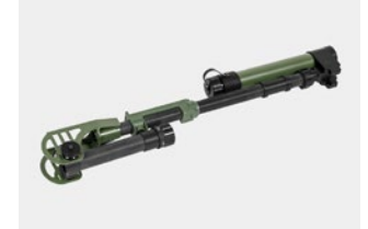
Carrying bar VX1 Item No. 2903170030