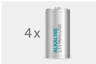
Alkaline battery 1.5 V Mono LR20, 4 ea. Item No. 5910001006S4