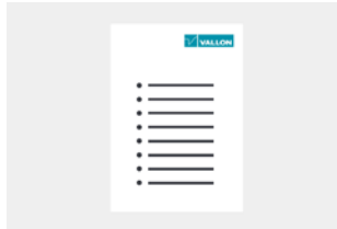
Operation manual VX1 Item No. 2903170330