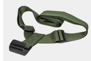
Carrying strap VX1 Item No. 8903170820