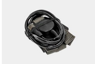
Headset VX1/VXT1 Item No. 2903170320