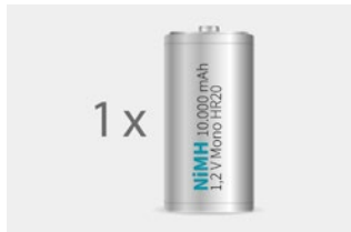
Rechargeable battery NiMH 1,2 V Mono HR20/10.000 mAh Item No. 5920001006