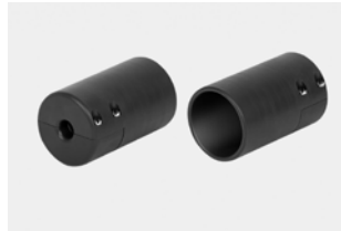
Borehole Shaft Guard Item No. 2900130170