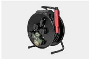
Cable drum VX1 SEPOS®, 15/12 m Item No. 2903170470