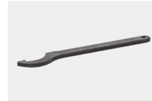
Hook wrench Item No. 9150006024