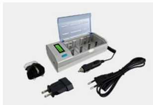
External battery charger 100-240V/50-60Hz, 12V Item No. 2909990847