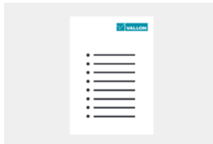
Operation manual VX1 Item No. 2903170330