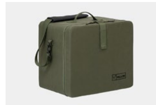
Carrying bag VX1 cable drum Item No. 2903170401