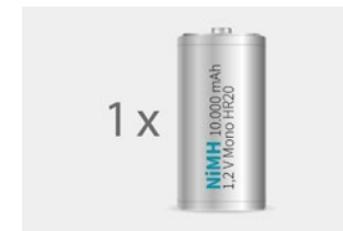
Rechargeable battery NiMH 1,2 V Mono HR20/10.000 mAh Item No. 5920001006