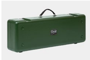
Case VX1 Item No. 2903170410