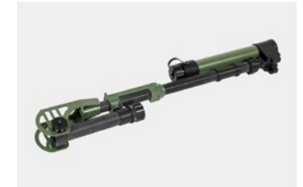
Carrying bar VX1 Item No. 2903170030