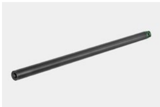
Digital probe VSM4 Item No. 2005320010