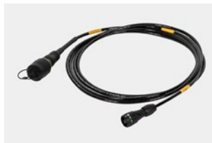
Connection cable SEPOS®-Borehole (VX1) Item No. 2503170040