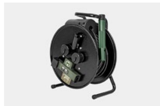
Cable drum VX1 SEPOS®, 15/12 m Item No. 2903170470