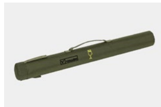
Transport bag for digital probe VSM4 Item No. 2903170450