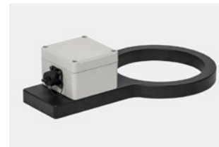
Detector SEPOS®-Borehole Item No. 2900130130