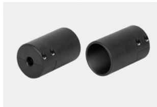
Borehole Shaft Guard Item No. 2900130170