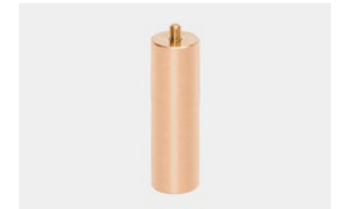
Extra weight Item No. 2909990631