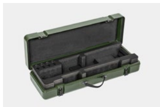
Hard case VX1 with insert Item No. 2903170530