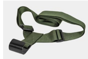
Carrying strap VX1 Item No. 8903170820