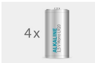
Alkaline battery 1.5 V Mono LR20, 4 ea. Item No. 5910001006S4