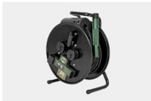
Cable drum VX1, 25 m Item No. 2903170260