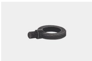
Ring screw Item No. 2909990105