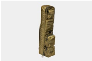
Backpack VX1 Item No. 8903170610