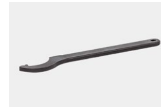
Hook wrench Item No. 9150006024