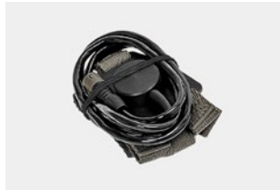
Headset VX1/VXT1 Item No. 2903170320