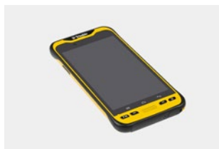
VFC4 – Small Field Computer for EVA4mobile® Item No. 2005350001