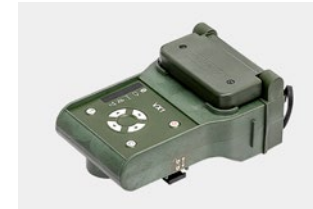
Control unit VX1 Item No. 2903170040