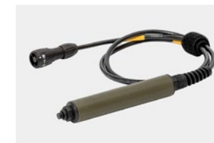
Hand switch start/stop VX1 Item No. 2503170160