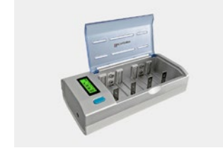
External battery charger 100-240V/50-60Hz, 12V Item No. 2909990847