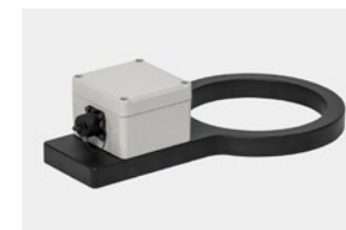
Detector SEPOS®-Borehole Item No. 2900130130