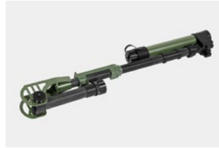
Carrying bar VX1 Item No. 2903170030