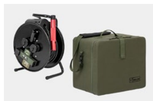
Cable drum VX1, 25 m (completely) Item No. 2903170240