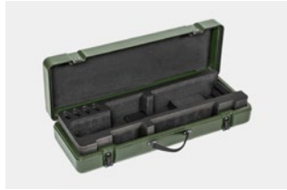
Hard case VX1 with insert Item No. 2903170530