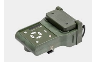
Control unit VX1 Item No. 2903170040