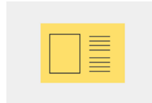
Backpack packing sketch VX1 Item No. 8903170890