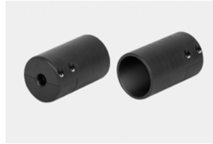
Borehole Shaft Guard Item No. 2900130170