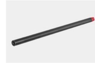
Digital probe VSM Item No. 2909990674