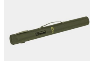
Transport bag for digital probe VSM Item No. 2903170450