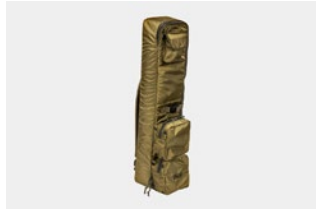
Backpack VX1 Item No. 8903170610