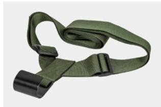
Carrying strap VX1 Item No. 8903170820