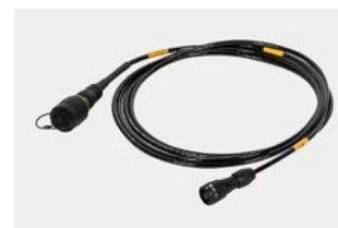
Connection cable SEPOS®-Borehole (VX1) Item No. 2503170040