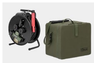
Cable drum VX1 SEPOS®, 15/12 m (completely) Item No. 2903170460