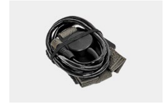
Headset VX1/VXT1 Item No. 2903170320