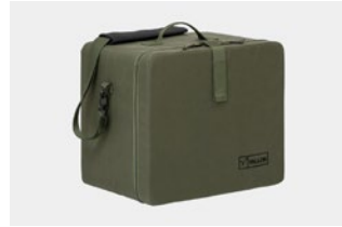
Carrying bag VX1 cable drum Item No. 2903170401