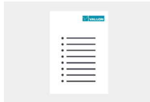
Operation manual VX1 Item No. 2903170330