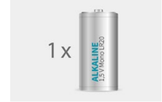
Alkaline battery 1.5 V Mono LR20 Item No. 5910001006