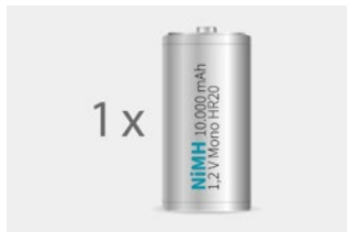
Rechargeable battery NiMH 1,2 V Mono HR20/10.000 mAh Item No. 5920001006