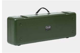
Case VX1 Item No. 2903170410