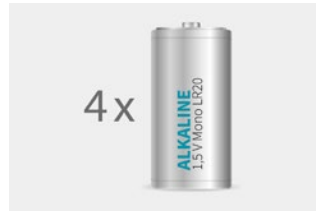
Alkaline battery 1.5 V Mono LR20, 4 ea. Item No. 5910001006S4