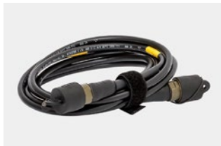
Connection cable SEPOS®-Borehole (VCU) Item No. 2500130032