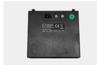
Battery VXB2/VXB3 Item No. 2902540104