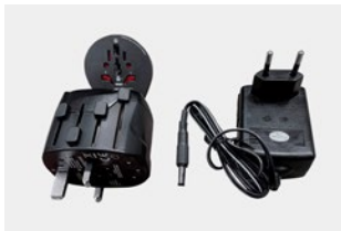
Kit Battery charger Item No. 2902540110