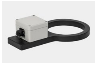
Detector SEPOS®-Borehole Item No. 2900130130