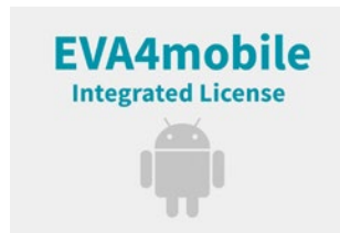
EVA4mobile® – Integrated license in combination with field computer VFC4.1 Item No. 2405350010