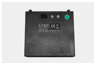
Battery VXB2/VXB3.1 Item No. 2902540104