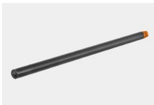
Digital probe VSM4plus Item No. 2005320020