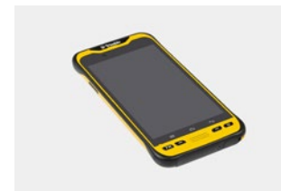
VFC4.1 – Small Field Computer for EVA4mobile® Item No. 2005350001