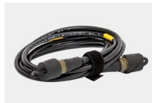
Connection cable SEPOS®-Borehole (VCU) Item No. 2500130032