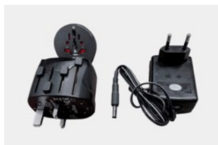
Kit Battery charger Item No. 2902540110