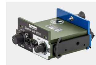
Central electronics unit VCU3 Item No. 2002540310