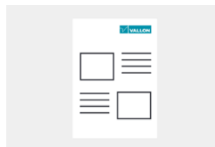
Operation manual VFC4.1 Item No. 8905350000