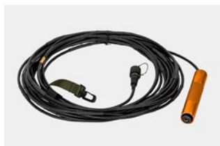
Sensor cable VXB3.1 SEPOS®, 15 m/12 m Item No. 2502590201