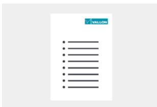
Operation manual VCU2 Item No. 8902540103