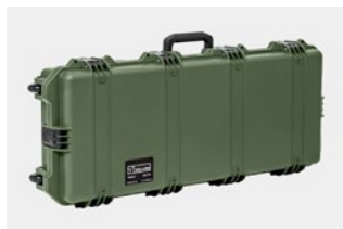
Case sensor set VXB3.1 Item No. 2902590081