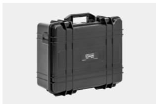
Case electronics set VXB3.1 Item No. 2902590162