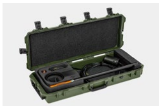
Sensor set VXB3.1 Item No. 2902590201