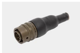
Headset adapter 6 Pole, 3rd generation Item No. 2909990751