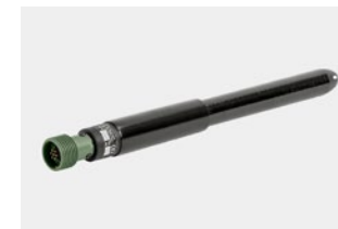
Stick probe VMH3S Item No. 2802360002