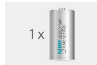
Rechargeable battery NiMH 1,2 V Mono HR20/10.000 mAh Item No. 5920001006