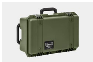
Case VMH3CS Item No. 2802360101