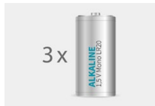
Alkaline battery 1.5 V Mono LR20, 3 ea. Item No. 5910001006S3