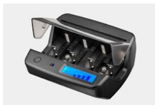
External battery charger 100-240V/50-60Hz, 12V Item No. 5900001010