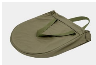
Bag UXO search coil large, olive Item No. 8702360002