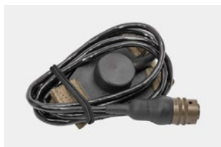
Headset VMC1/VMH3CS/VMXC1-1 Item No. 2909990571