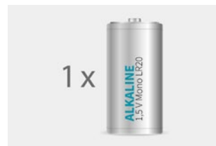
Alkaline battery 1.5 V Mono LR20 Item No. 5910001006