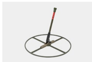
UXO search coil, Ø 60 cm Item No. 2902360111