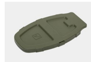
Cover for search coil, oval Item No. 8902293002