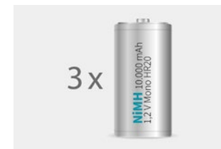
Rechargeable battery NiMH 1,2 V Mono HR20/10.000 mAh, 3 ea. Item No. 5920001006S3