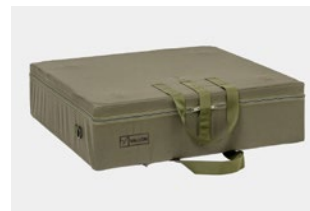
Universal case UXO search coil large Item No. 2802360102