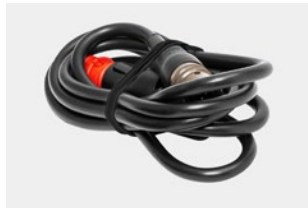
Charging cable for 12V/24V vehicle plug socket Item No. 2502440006