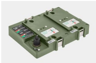
Battery charger VAP3 Item No. 2902830018