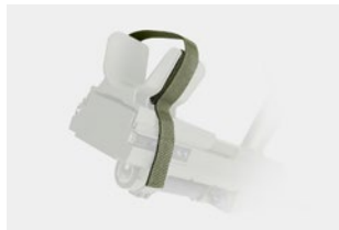
Arm strap Item No. 8909990832