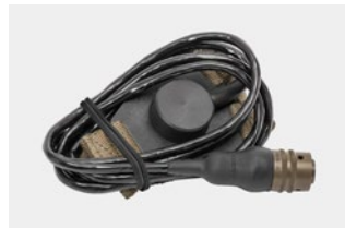
Headphone VMR3/VMR3G/VR1 Item No. 2902440026