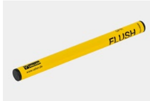
Test piece "GPR-Flush" Item No. 2902440095