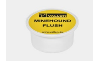
Test piece "Minehound-Flush" Item No. 2902440075