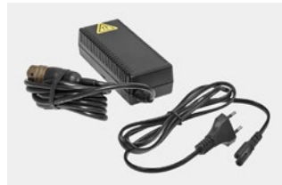
Power adapter for battery charger VAP3 Item No. 2902440126