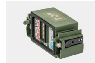
Rechargeable battery block VAP3 Item No. 2902830035