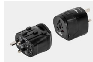
Universal power plug adapter Item No. 9150006102