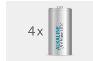
Alkaline battery 1.5 V Mono LR20, 4 ea. Item No. 5910001006S4