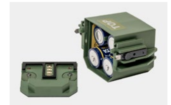
Battery compartment VBH3 Item No. 2902830080