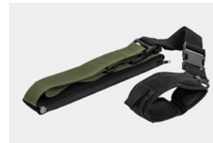
Shoulder straps with pads VMR2/ VMR3/VR1 Item No. 2902440123