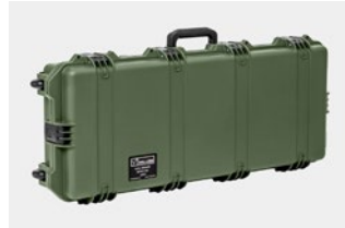
Case VMR3 Item No. 2902830064