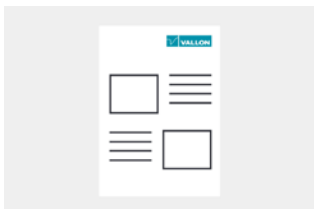
Field manual VMR3 Item No. 8902830072