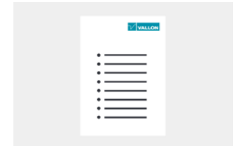
Operation manual VMR3 Item No. 8902830071