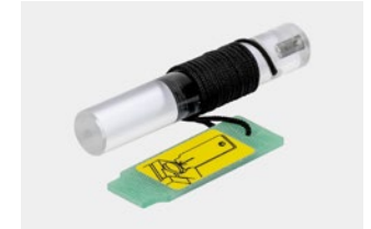
Test piece with adjustment plate for brake screw Item No. 2909990733