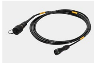
Connection cable SEPOS®-Borehole (VX1) Item No. 2503170040