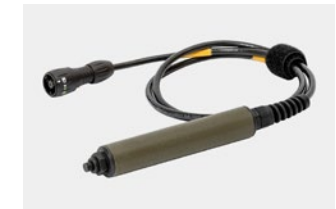
Hand switch start/stop VX1 Item No. 2503170160