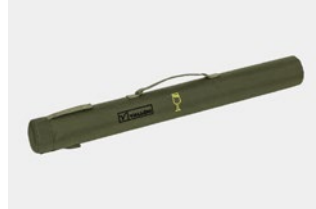
Transport bag for digital probe VSM Item No. 2903170450