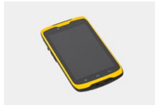
VFC4 – Small Field Computer for EVA4mobile® Item No. 2005350000