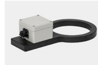
Detector SEPOS®-Borehole Item No. 2900130130