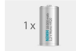
Rechargeable battery NiMH 1,2 V Mono HR20/10.000 mAh Item No. 5920001006