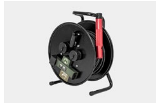
Cable drum VX1 SEPOS®, 15/12 m Item No. 2903170470