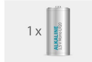
Alkaline battery 1.5 V Mono LR20 Item No. 5910001006