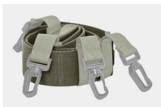
Waist belt Item No. 9150006007