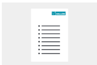
Operation manual VCU2 Item No. 8902540103