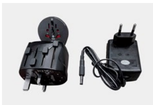
Kit Battery charger Item No. 2902540110