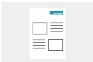
Operation manual VFC4 Item No. 8905350000