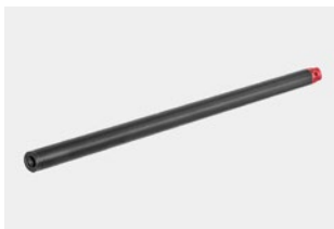
Digital probe VSM Item No. 2909990674