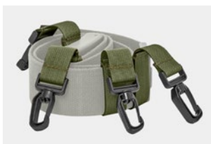
Carabiner for belt Item No. 8902590005