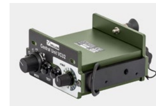
Central electronics unit VCU2 Item No. 2002540110