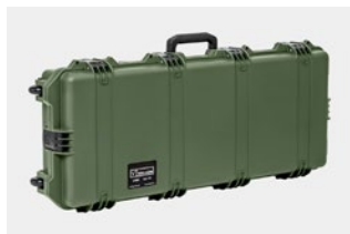
Case sensor set VXB2 Item No. 2802590001