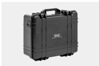
Case electronics set VXB2 Item No. 2802590002