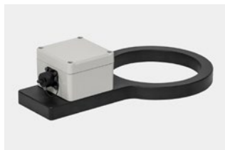
Detector SEPOS®-Borehole Item No. 2900130130