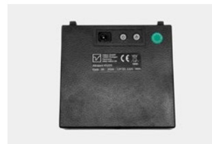
Battery VXB2/VXB3 Item No. 2902540104