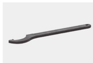
Hook wrench Item No. 9150006024