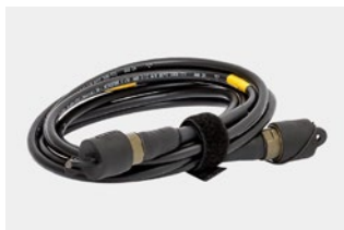
Connection cable SEPOS®-Borehole (VCU) Item No. 2500130032