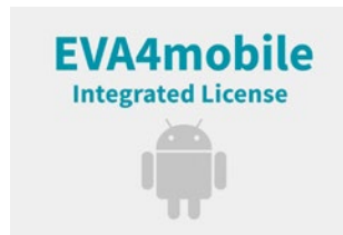
EVA4mobile® – Integrated license in combination with field computer VFC4 Item No. 2405350010