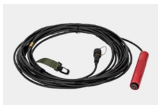
Sensor cable VXB2 SEPOS®, 15 m/12 m Item No. 2502590001