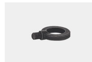
Ring screw Item No. 2909990105