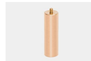
Extra weight Item No. 2909990631