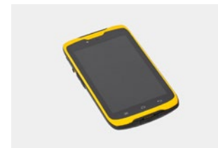
VFC4 – Small Field Computer for EVA4mobile® Art.-Nr. 2005350000