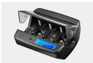
External battery charger 100-240V/50-60Hz, 12V Item No. 5900001010