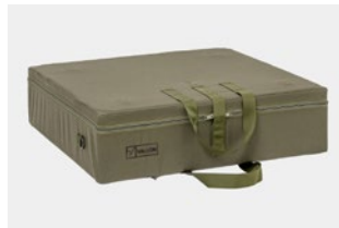
Universal case UXO search coil large Item No. 2802360102