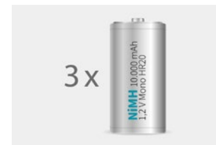
Rechargeable battery NiMH 1,2 V Mono HR20/10.000 mAh, 3 ea. Item No. 5920001006S3