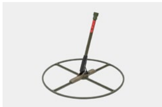
UXO search coil, Ø 60 cm Item No. 2902360111