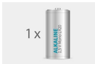
Alkaline battery 1.5 V Mono LR20 Item No. 5910001006