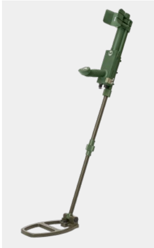
Metal Detector VMH3CS