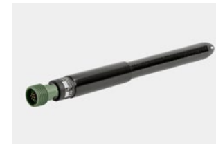
Stick probe VMH3S Item No. 2802360002