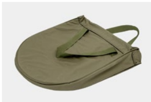
Bag UXO search coil large, olive Item No. 8702360002