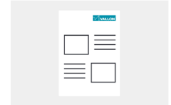
Field manual VMH3CS Item No. 2902360407