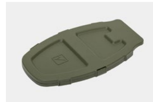
Cover for search coil, oval Item No. 8902293002