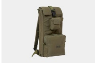
Backpack VMH3CS Item No. 8902360007