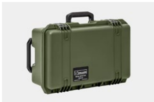
Case VMH3CS Item No. 2802360101