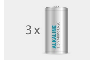
Alkaline battery 1.5 V Mono LR20, 3 ea. Item No. 5910001006S3