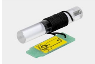
Test piece with adjustment plate for brake screw Item No. 2909990733