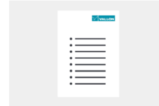
Operation manual VMH3CS Item No. 2902360406