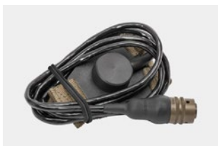
Headset VMC1/VMH3CS/VMXC1-1 Item No. 2909990571