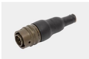
Headset adapter 6 Pole, 3rd generation Item No. 2909990751