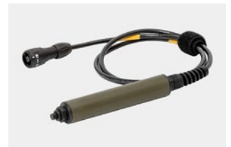
Hand switch start/stop VX1 Art.-Nr. 2503170160