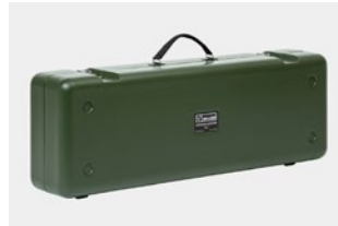
Case VX1 Item No. 2903170410