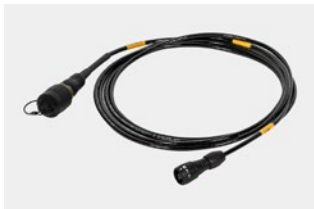
Anschlusskabel SEPOS®-Bohrloch Art.-Nr. 2503170040