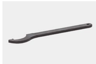
Hook wrench Item No. 9150006024