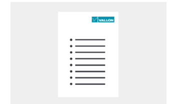
Operation manual VX1 Item No. 2903170330