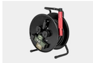
Cable drum VX1 SEPOS®, 15/12 m Item No. 2903170470