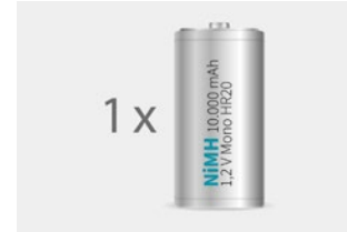
Rechargeable battery NiMH 1,2 V Mono HR20/10.000 mAh Item No. 5920001006