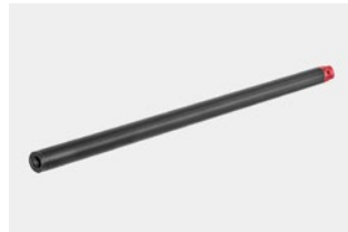
Digital probe VSM Item No. 2909990674