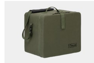
Carrying bag VX1 cable drum Item No. 2903170400