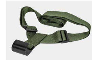
Carrying strap VX1 Item No. 8903170820