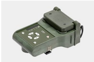
Control unit VX1 Item No. 2903170040