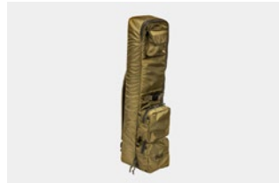
Backpack VX1 Item No. 8903170610