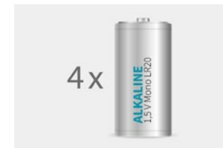
Alkaline battery 1.5 V Mono LR20, 4 ea. Item No. 5910001006S4