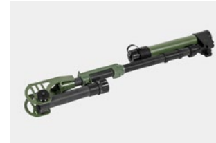
Carrying bar VX1 Item No. 2903170030