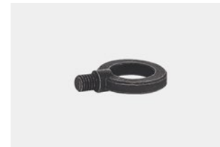
Ring screw Item No. 2909990105