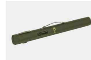
Transport bag for digital probe VSM Item No. 2903170450