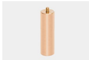
Extra weight Item No. 2909990631