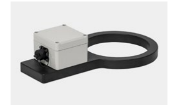
Detektor SEPOS®-Bohrloch Art.-Nr. 2900130130