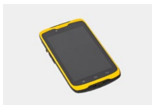
VFC4 – Small Field Computer for EVA4mobile® Art.-Nr. 2005350000