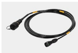
Connection cable SEPOS®-Borehole Item No. 2503170040