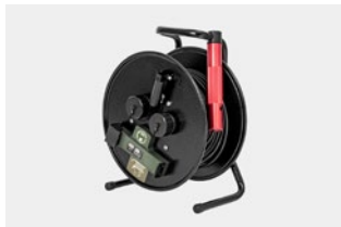
Cable drum VX1, 25 m Item No. 2903170260