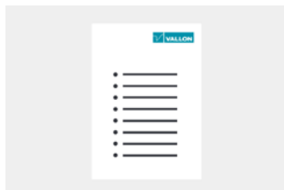
Operation manual VX1 Item No. 2903170330