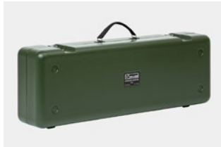
Case VX1 Item No. 2903170410