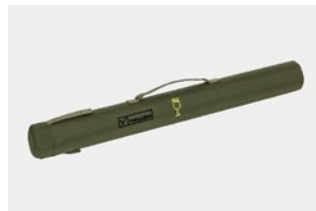
Transport bag for digital probe VSM Item No. 2903170450