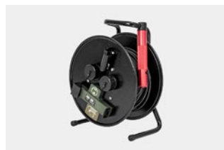
Cable drum VX1 SEPOS®, 15/12 m Item No. 2903170470