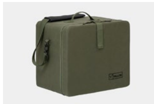
Carrying bag VX1 cable drum Item No. 2903170400