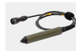
Hand switch start/stop VX1 Art.-Nr. 2503170160