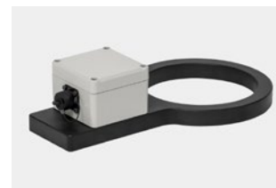
Detector SEPOS®-Borehole Item No. 2900130130