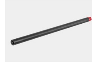
Digital probe VSM Item No. 2909990674