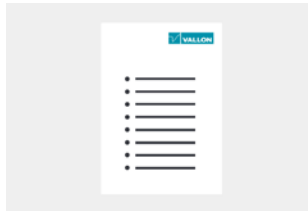
Operation manual VX1 Item No. 2903170330