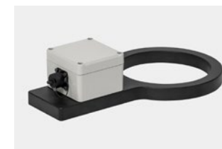
Detector SEPOS®-Borehole Item No. 2900130130