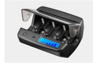
External battery charger 100-240V/50-60Hz, 12V Item No. 5900001010