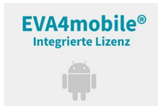
EVA4mobile® - Integrated license in combination with field computer VFC4 Item No. 2405350010