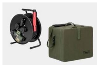
Cable drum VX1, 25 m (completely) Item No. 2903170240