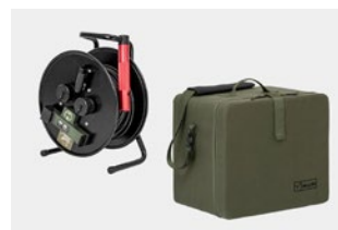
Cable drum VX1 SEPOS®, 15/12 m (completely) Item No. 2903170460