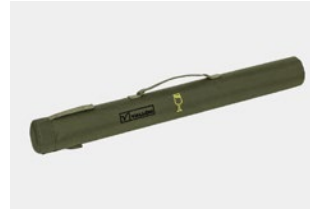
Transport bag for digital probe VSM Item No. 2903170450