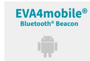
EVA4mobile® - Bluetooth® Beacon for temporary license activation Item No. 2009080000