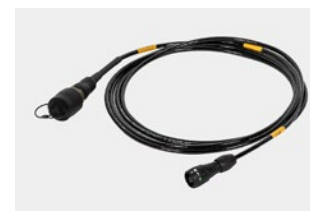
Connection cable SEPOS®-Borehole Item No. 2503170040