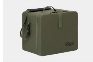
Carrying bag VX1 cable drum Item No. 2903170400