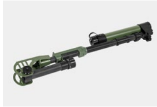
Carrying bar VX1 Item No. 2903170030