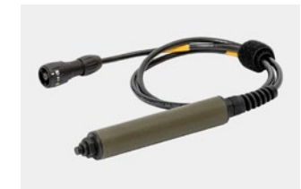
Hand switch start/stop VX1 Art.-Nr. 2503170160