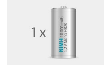
Rechargeable battery NiMH 1,2 V Mono HR20/10.000 mAh Item No. 5920001006