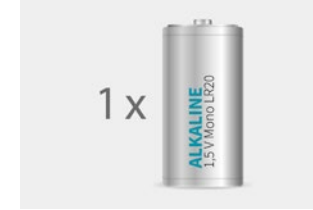
Alkaline battery 1.5 V Mono LR20 Item No. 5910001006