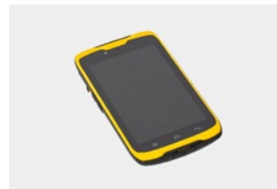
VFC4 - Small Field Computer for EVA4mobile® Art.-Nr. 2005350000