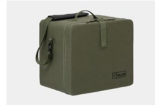
Carrying bag VX1 cable drum Item No. 2903170400