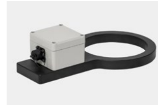
Detector SEPOS®-Borehole Item No. 2900130130