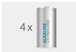
AAlkaline battery 1.5 V Mono LR20, 4 ea. Item No. 5910001006S4