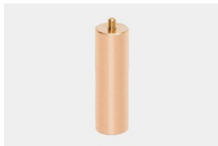
Extra weight Item No. 2909990631