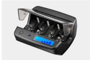
External battery charger 100-240V/50-60Hz, 12V Item No. 5900001010