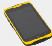
VFC4 – Small Field Computer for EVA4mobile® Art.-Nr. 2005350000