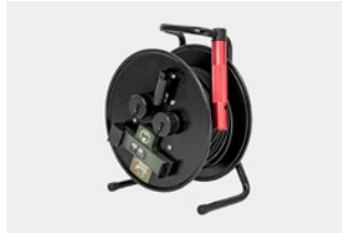
Cable drum VX1, 25 m Art.-Nr. 2903170260