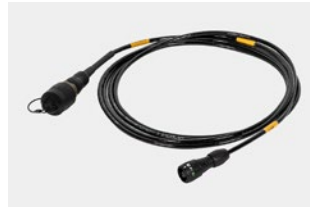
Connection cable SEPOS®-Borehole Item No. 2503170040