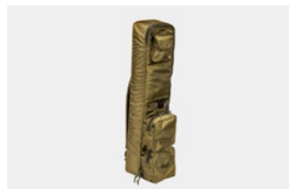
Backpack VX1 Item No. 8903170610