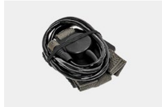
Headset VX1/VXT1 Item No. 2903170320