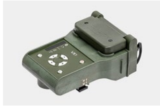
Control unit VX1 Item No. 2903170040