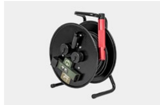
Cable drum VX1 SEPOS®, 15/12 m Item No. 2903170470