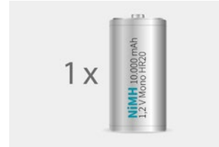
Rechargeable battery NiMH 1,2 V Mono HR20/10.000 mAh Item No. 5920001006