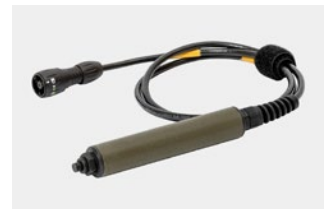
Hand switch start/stop VX1 Art.-Nr. 2503170160