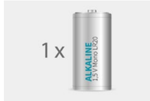
Alkaline battery 1.5 V Mono LR20 Item No. 5910001006