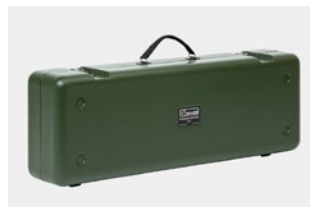
Case VX1 Item No. 2903170410