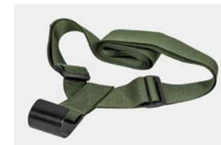
Carrying strap VX1 Item No. 8903170820