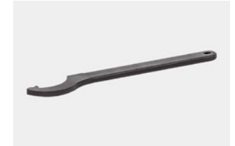
Hook wrench Item No. 9150006024