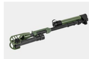
Carrying bar VX1 Item No. 2903170030