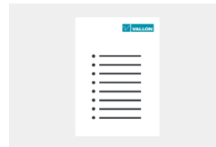
Operation manual VX1 Item No. 2903170330