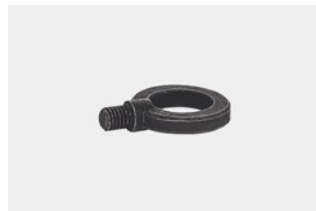
Ring screw Item No. 2909990105