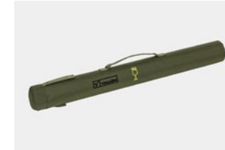
Transport bag for digital probe VSM Item No. 2903170450