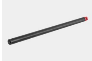
Digital probe VSM Item No. 2909990674