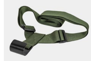
Carrying strap VX1 Item No. 8903170820