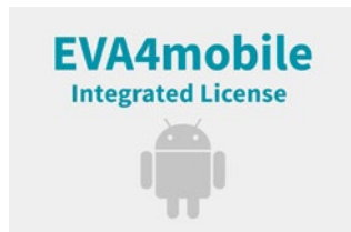
EVA4mobile® – Integrated license in combination with field computer VFC4.1 Item No. 2405350010