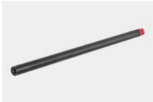
Digital probe VSM Item No. 2909990674