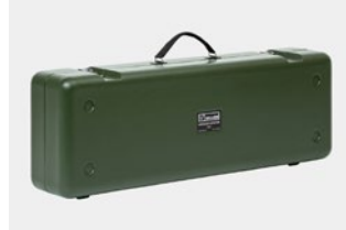
Case VX1 Item No. 2903170410