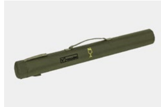
Transport bag for digital probe VSM Item No. 2903170450