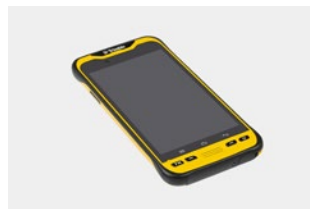
VFC4 – Small Field Computer for EVA4mobile® Item No. 2005350001