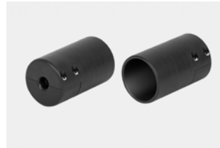
Borehole Shaft Guard Item No. 2900130170