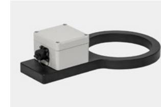
Detector SEPOS®-Borehole Item No. 2900130130