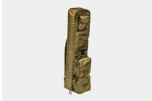
Backpack VX1 Item No. 8903170610