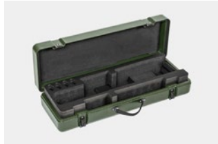
Hard case VX1 with insert Item No. 2903170530