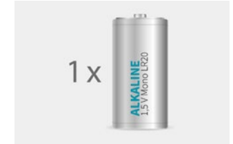
Alkaline battery 1.5 V Mono LR20 Item No. 5910001006