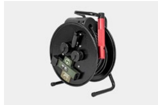
Cable drum VX1 SEPOS®, 15/12 m Item No. 2903170470