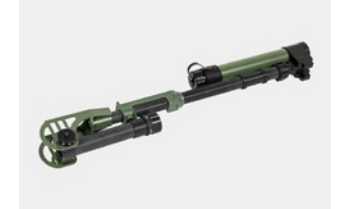
Carrying bar VX1 Item No. 2903170030