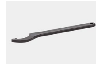
Hook wrench Item No. 9150006024