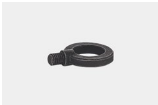
Ring screw Item No. 2909990105