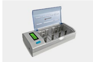
External battery charger 100-240V/50-60Hz, 12V Item No. 2909990847