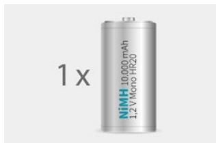
Rechargeable battery NiMH 1,2 V Mono HR20/10.000 mAh Item No. 5920001006