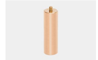
Extra weight Item No. 2909990631