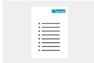
Operation manual VX1 Item No. 2903170330