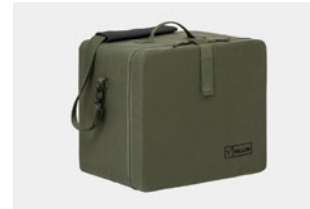
Carrying bag VX1 cable drum Item No. 2903170401