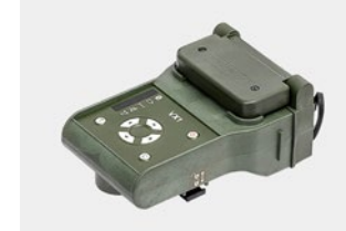
Control unit VX1 Item No. 2903170040