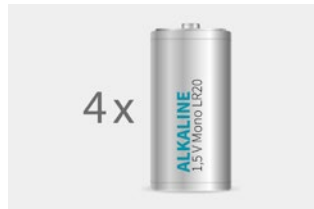
Alkaline battery 1.5 V Mono LR20, 4 ea. Item No. 5910001006S4