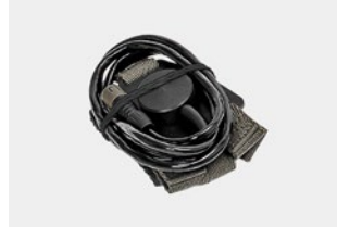
Headset VX1/VXT1 Item No. 2903170320