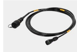
Connection cable SEPOS®-Borehole (VX1) Item No. 2503170040