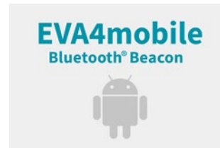
EVA4mobile® – Bluetooth® Beacon for temporary license activation Item No. 2009080000