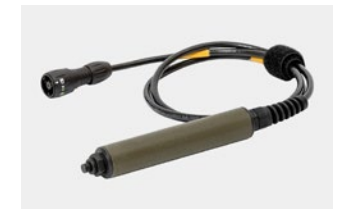
Hand switch start/stop VX1 Item No. 2503170160