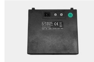
Battery VXB2/VXB3 Item No. 2902540104