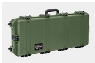
Case sensor set VXB3 Item No. 2902590103