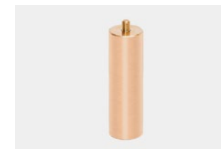
Extra weight Item No. 2909990631