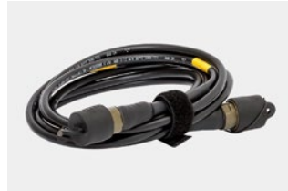
Connection cable SEPOS®-Borehole Item No. 2500130032