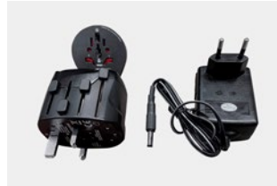
Kit Battery charger Item No. 2902540110