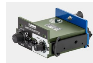
Central electronics unit VCU3 Item No. 2002540310