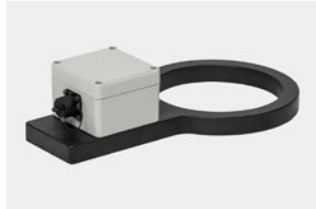
Detector SEPOS®-Borehole Item No. 2900130130