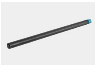
Digital probe VSM3 Item No. 2902280104