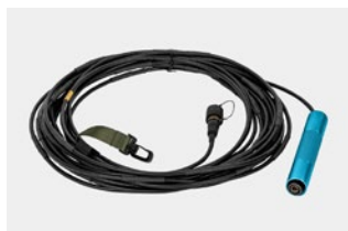
Sensor cable VXB3 SEPOS®, 15 m/12 m Item No. 2502590101