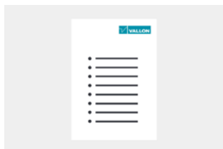
Operation manual VCU2 Item No. 8902540103