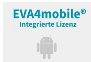
EVA4mobile® – Integrated license in combination with field computer VFC4 Item No. 2405350010