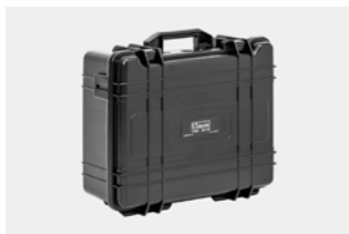
Case electronics set VXB3 Item No. 2902590104