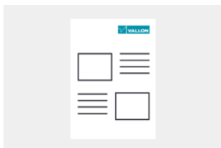
Operation manual VFC4 Item No. 8905350000