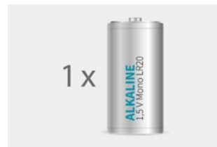
Alkaline battery 1.5 V Mono LR20 Item No. 5910001006