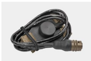
Headset VMC1/VMH3CS/VMXC1-1 Item No. 2909990571