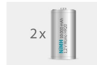
Rechargeable battery NiMH 1,2 V Mono HR20/10.000 mAh, 2 ea Item No. 5920001006S2