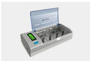
External battery charger 100-240V/50-60Hz, 12V Item No. 2909990847