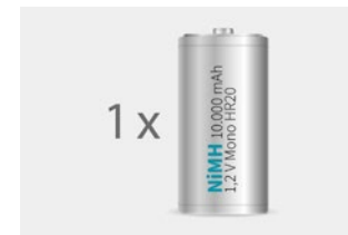
Rechargeable battery NiMH 1,2 V Mono HR20/10.000 mAh Item No. 5920001006