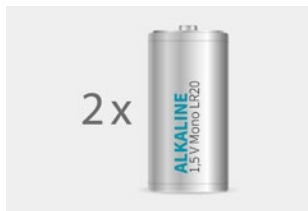
Alkaline battery 1.5 V Mono LR20, 2 ea. Item No. 5910001006S2