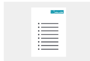
Operation manual VXC1 Item No. 2902460020