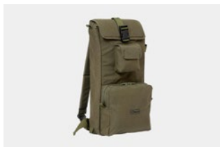
Backpack VXC1 Item No. 8902460102