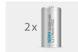
Rechargeable battery NiMH 1,2 V Mono HR20/10.000 mAh, 2 ea Item No. 5920001006S2