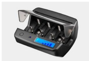
External battery charger 100-240V/50-60Hz, 12V Item No. 5900001010