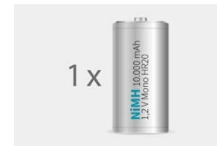
Rechargeable battery NiMH 1,2 V Mono HR20/10.000 mAh Item No. 5920001006