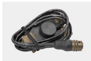
Headset VMC1/VMH3CS/VMXC1-1 Item No. 2909990571