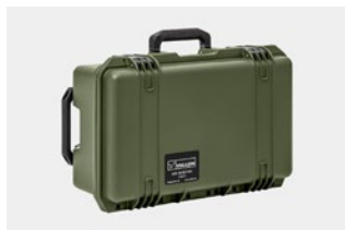
Case VXC1 Item No. 2802460001