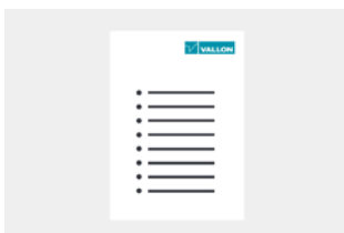
Operation manual MW1630B Item No. 8900530011