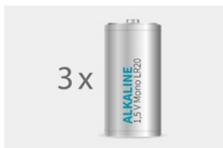
Alkaline battery 1.5 V Mono LR2, 3 ea. Réf. 5910001006S3