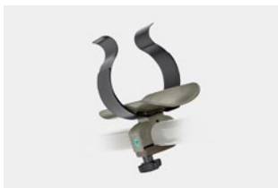
Arm rest MW1630B Item No. 2900500009