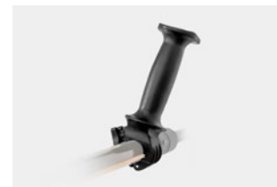
Handle MW1630B Item No. 2900920016