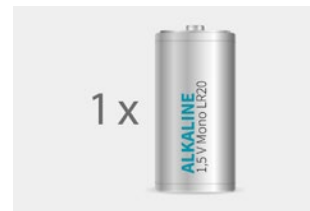
Alkaline battery 1.5 V Mono LR20 Item No. 5910001006