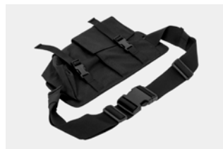
Pouch for the electronics unit MW1630B Item No. 8900530030