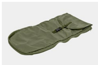
Backpack MW1630B Item No. 8900530008