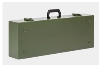
Case MW1630B Item No. 2800530010