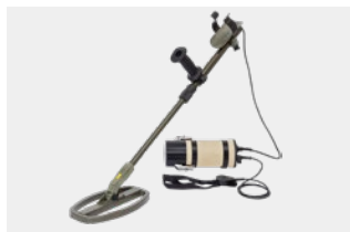
Metal Detector MW1630B