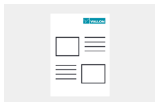
Field manual MW1630B Item No. 2900530011