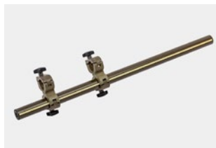
Extension tube for carrying bar MW1630B Item No. 2900530005