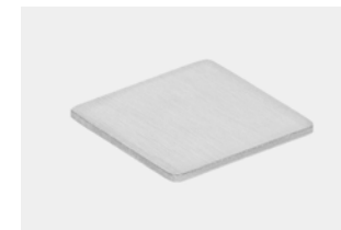
Test piece 35 X 35 X 2 aluminum (non-magnetic) Item No. 8909990384