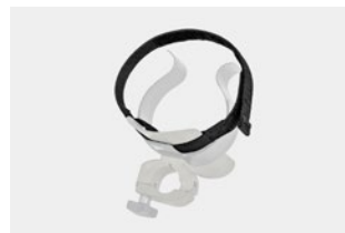
Additional strap for arm rest MW1630B Item No. 8709990010