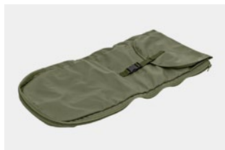
Backpack MW1630B Item No. 8900530008