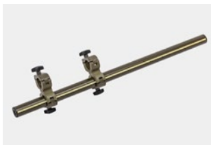
Extension tube for carrying bar MW1630B Item No. 2900530005