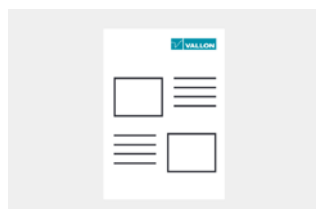
Field manual MW1630B Item No. 2900530011