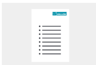
Operation manual MW1630B Item No. 8900530011