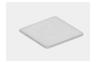
Test piece 35 X 35 X 2 aluminum (non-magnetic) Item No. 8909990384