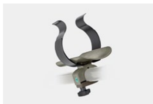
Arm rest MW1630B Item No. 2900500009