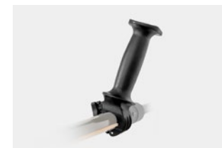
Handle MW1630B Item No. 2900920016