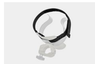
Additional strap for arm rest MW1630B Item No. 8709990010