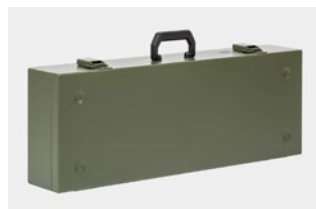
Case MW1630B Item No. 2800530010