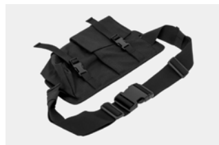
Pouch for the electronics unit MW1630B Item No. 8900530030