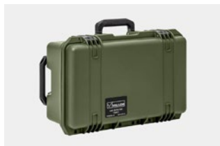
Case VMXC1-1 Item No. 2802530002