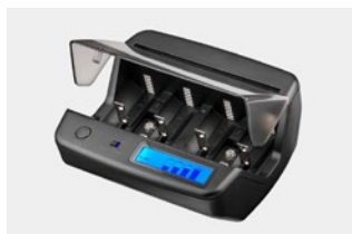
External battery charger 100-240V/50-60Hz, 12V Item No. 5900001010