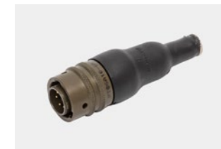
Headset adapter 6 Pole, 3rd generation Item No. 2909990751