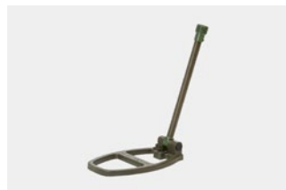
Search coil VMH3CS/VMXC1, oval Item No. 2902360101