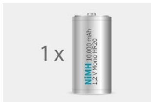
Rechargeable battery NiMH 1,2 V Mono HR20/10.000 mAh Item No. 5920001006