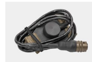
Headset VMC1/VMH3CS/VMXC1-1 Item No. 2909990571