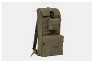
Backpack VMXC1-3 Item No. 8902530002