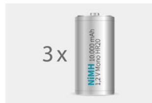
Rechargeable battery NiMH 1,2 V Mono HR20/10.000 mAh, 3 ea. Item No. 5920001006S3