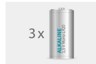
Alkaline battery 1.5 V Mono LR20, 3 e Item No. 5910001006S3