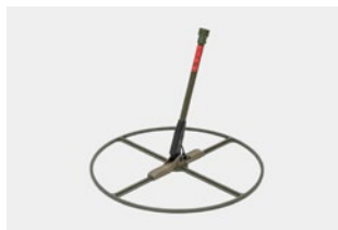
UXO search coil, Ø 61 cm Item No. 2902360111