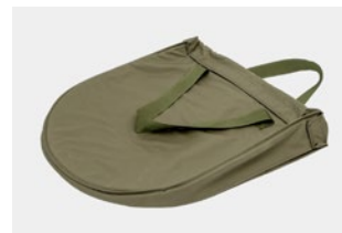
Bag UXO search coil large, olive Item No. 8702360002