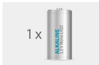
Alkaline battery 1.5 V Mono LR20 Item No. 5910001006