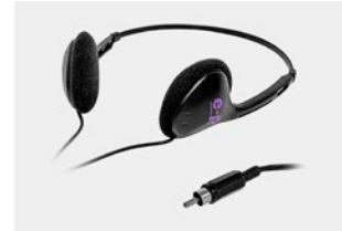
Headset Art.-Nr. 2800340001