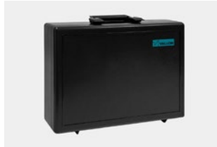
Carrying Case Art.-Nr. 8900330006