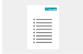
Operation manual MH6 Item No. 8900340300