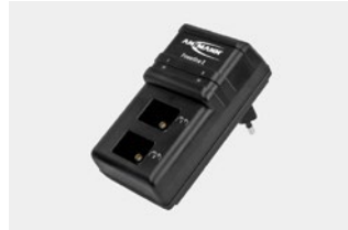
Charger Art.-Nr. 5900002010