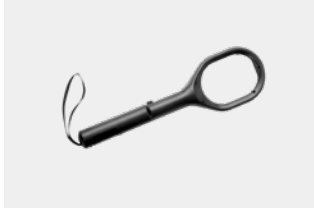
Handheld Metal Detector MH6