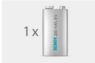
Rechargeable battery NiMH 9/200mAh Art.-Nr. 5920001001