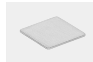
Test piece 35 X 35 X 2 aluminum (non-magnetic) Item No. 8909990384