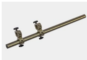
Extension tube for carrying bar MW1630B Item No. 2900530005