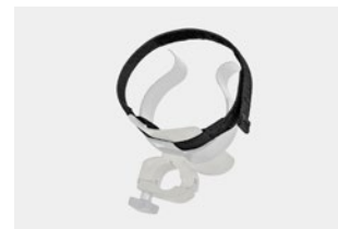
Additional strap for arm rest MW1630B Item No. 8709990010