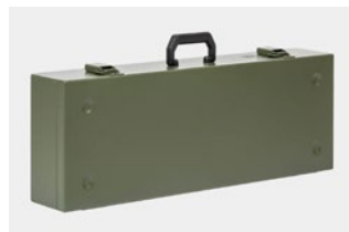
Case MW1630B Item No. 2800530010