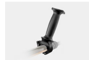
Handle MW1630B Item No. 2900920016