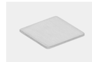
Test piece 35 X 35 X 2 aluminum (non-magnetic) Item No. 8909990384