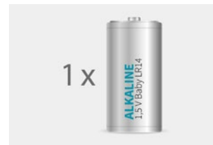
Alkaline battery 1.5 V Baby LR14 Item No. 5910001002