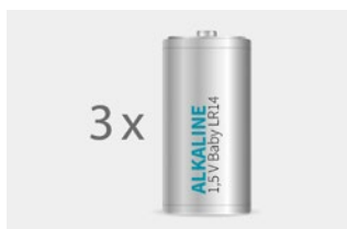
Alkaline battery 1.5 V Baby LR14, 3 ea. Item No. 5910001002S3