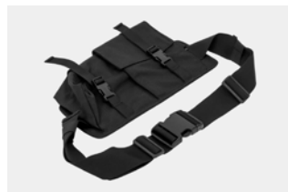
Pouch for the electronics unit MW1630B Item No. 8900530030