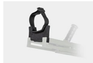
Strap for arm rest VMC1/VMW1 Item No. 8702310101