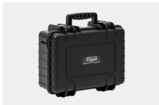
Case VMC1 Item No. 2802310010