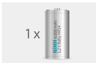
Rechargeable battery NiMH 1,2 V baby HR14/6.000 mAh Item No. 5920001018