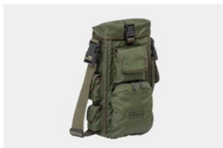
Carrying bag VMC1/VMW1 Item No. 8902310030