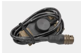
Headset VMC1/VMH3CS/VMXC1-11 Item No. 2909990571