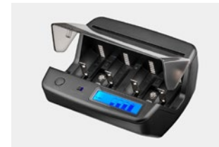
External battery charger 100-240V/50-60Hz, 12V Item No. 5900001010