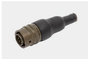
Headset adapter 6 Pole, 3rd generation Item No. 2909990751