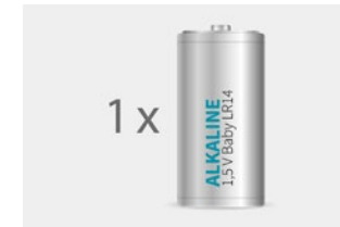
Alkaline battery 1.5 V baby LR14 Item No. 5910001002