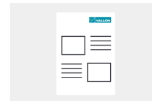
Field manual VMC1 Item No. 2902310115