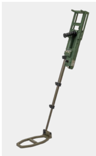
Metal Detector VMC1