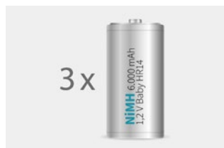
Rechargeable battery NiMH 1,2 V baby HR14/6.000 mAh, 3 ea. Item No. 5920001018S3