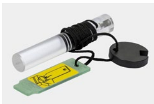
Test piece with adjustment plate for brake screw Item No. 2902310044