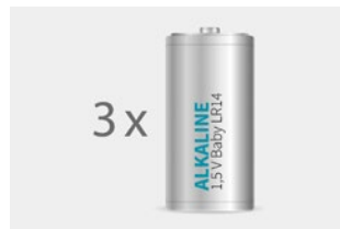
Alkaline battery 1.5 V baby LR14, 3 ea. Item No. 5910001002S3