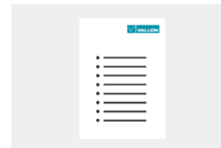
Operation manual VMC1 Item No. 2902310114