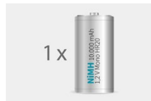
Rechargeable battery NiMH 1,2 V Mono HR20/10.000 mAh Item No. 5920001006