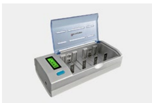
External battery charger 100-240V/50-60Hz, 12V Item No. 2909990847