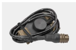
Headphone VMR3/VMR3G/VR1 Item No. 2902440026