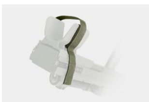
Arm strap Item No. 8909990832