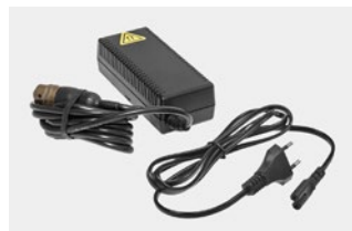
Power adapter for battery charger VAP3 Item No. 2902440126