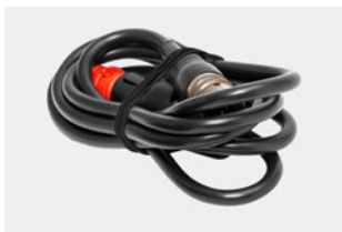
Charging cable for 12V/24V vehicle plug socket Item No. 2502440006