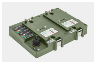
Battery charger VAP3 Item No. 2902830018