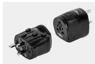
Universal power plug adapter Item No. 9150006102