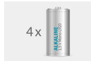
Alkaline battery 1.5 V Mono LR20, 4 ea. Item No. 5910001006S4