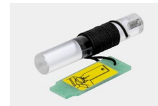
Test piece with adjustment plate for brake screw Item No. 2909990733