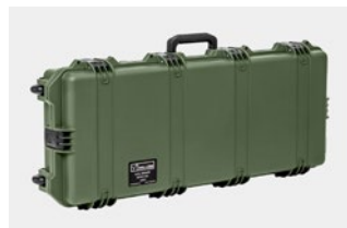
Case VMR3 Item No. 2902830064