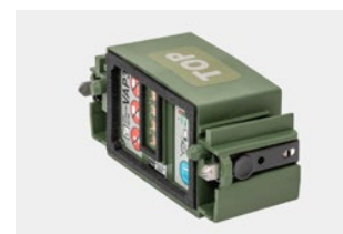
Rechargeable battery block VAP3 Item No. 2902830035