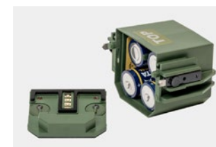
Battery compartment VBH3 Item No. 2902830080