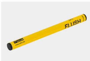
Test piece "GPR-Flush" Item No. 2902440095