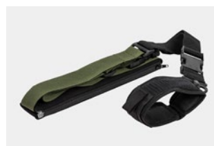
Shoulder straps with pads VMR2/ VMR3/VR1 Item No. 2902440123