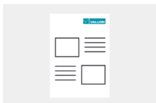
Field manual VMR3 Item No. 8902830072