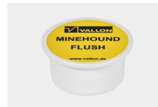
Test piece "Minehound-Flush" Item No. 2902440075