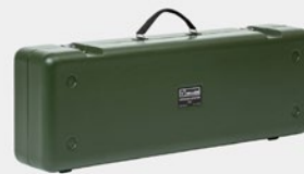
Case VX1 Item No. 2903170410