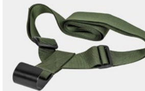
Carrying strap VX1 Item No. 8903170820