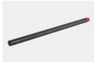
Digital probe VSM Item No. 2909990674