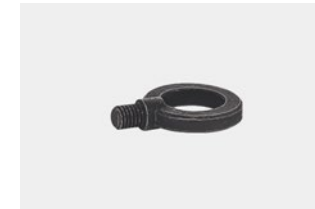
Ring screw Item No. 2909990105