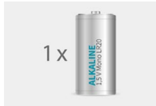
Alkaline battery 1.5 V Mono LR20 Item No. 5910001006