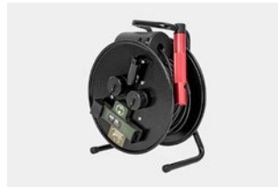
Cable drum VX1 SEPOS®, 15/12 m Item No. 2903170470