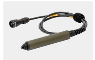
Hand switch start/stop VX1 Item No. 2503170160