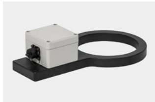
Detector SEPOS®-Borehole Item No. 2900130130