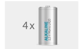
Alkaline battery 1.5 V Mono LR20, 4 ea. Item No. 5910001006S4