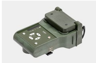
Control unit VX1 Item No. 2903170040