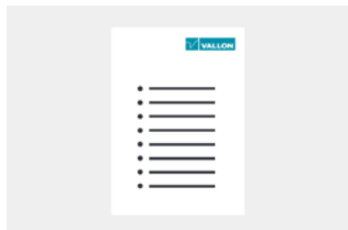
Operation manual VX1 Item No. 2903170330