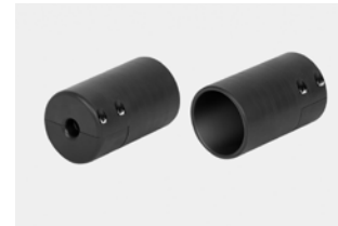
Borehole Shaft Guard Item No. 2900130170