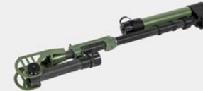
Carrying bar VX1 Item No. 2903170030