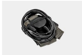
Headset VX1/VXT1 Item No. 2903170320