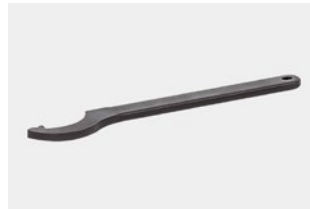
Hook wrench Item No. 9150006024