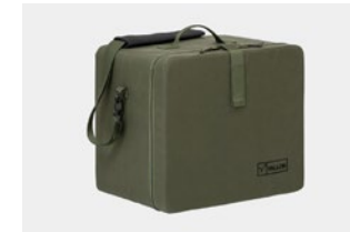
Carrying bag VX1 cable drum Item No. 2903170401