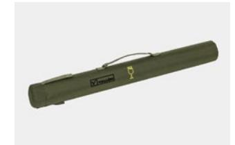
Transport bag for digital probe VSM Item No. 2903170450