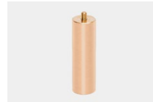
Extra weight Item No. 2909990631