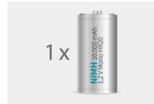
Rechargeable battery NiMH 1,2 V Mono HR20/10.000 mAh Item No. 5920001006