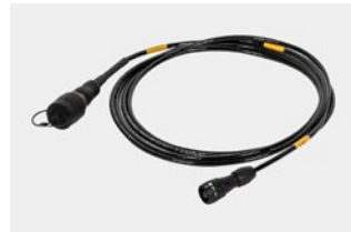
Connection cable SEPOS®-Borehole (VX1) Item No. 2503170040