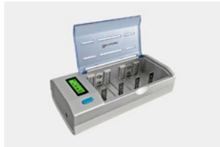
External battery charger 100-240V/50-60Hz, 12V Item No. 2909990847