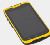
VFC4 - Small Field Computer for EVA4mobile® Item No. 2005350000