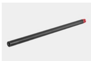
Digital probe VSM Item No. 2909990674