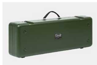
Case VX1 Item No. 2903170410