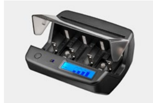
External battery charger 100-240V/50-60Hz, 12V Item No. 5900001010