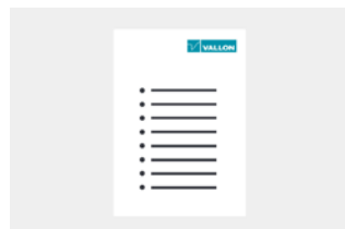
Operation manual VX1 Item No. 2903170330