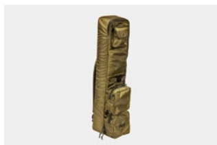
Backpack VX1 Item No. 8903170610