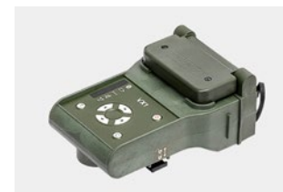
Control unit VX1 Item No. 2903170040