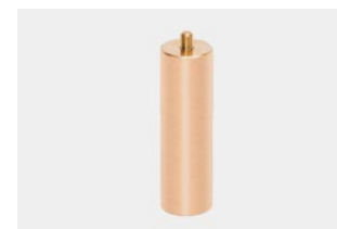
Extra weight Item No. 2909990631