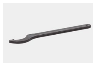
Hook wrench Item No. 9150006024