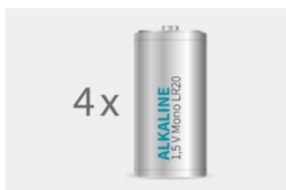
Alkaline battery 1.5 V Mono LR20, 4 ea. Item No. 5910001006S4