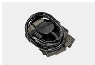
Headset VX1/VXT1 Item No. 2903170320