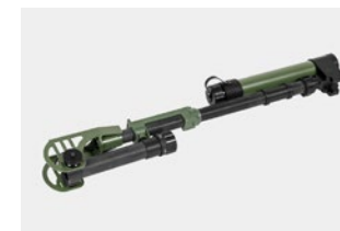
Carrying bar VX1 Item No. 2903170030