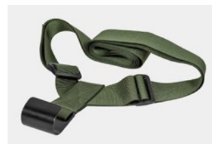
Carrying strap VX1 Item No. 8903170820