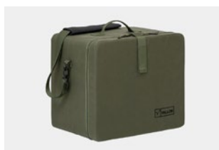
Carrying bag VX1 cable drum Item No. 2903170400