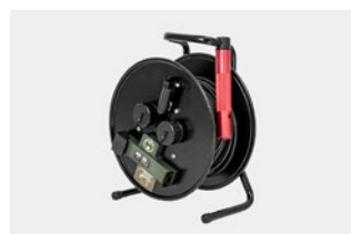
Cable drum VX1 SEPOS®, 15/12 m Item No. 2903170470