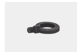
Ring screw Item No. 2909990105