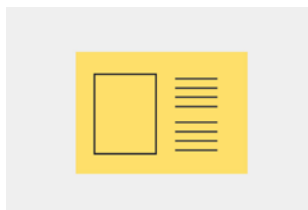
Backpack packing sketch VX1 Item No. 8903170890