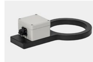
Detector SEPOS®-Borehole Item No. 2900130130