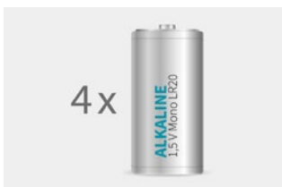
Alkaline battery 1.5 V Mono LR20, 4 ea. Item No. 5910001006S4