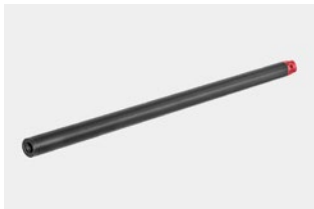
Digital probe VSM Item No. 2909990674