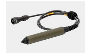
Hand switch start/stop VX1 Item No. 2503170160