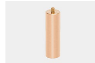
Extra weight Item No. 2909990631