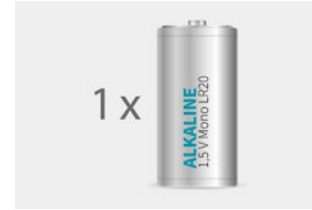
Alkaline battery 1.5 V Mono LR20 Item No. 5910001006