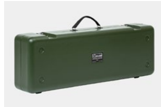
Case VX1 Item No. 2903170410