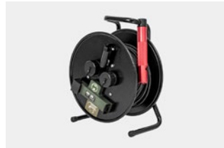
Cable drum VX1 SEPOS®, 15/12 m Item No. 2903170470