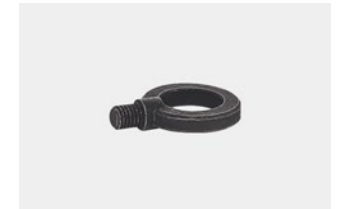
Ring screw Item No. 2909990105