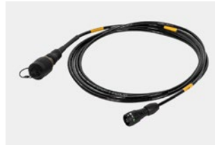
Connection cable SEPOS®-Borehole (VX1) Item No. 2503170040