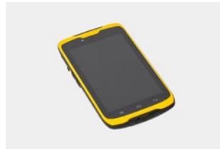
VFC4 – Small Field Computer for EVA4mobile® Item No. 2005350000