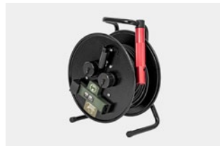
Cable drum VX1, 25 m Item No. 2903170260