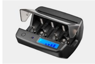
External battery charger 100-240V/50-60Hz, 12V Item No. 5900001010