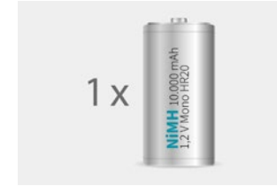
Rechargeable battery NiMH 1,2 V Mono HR20/10.000 mAh Item No. 5920001006