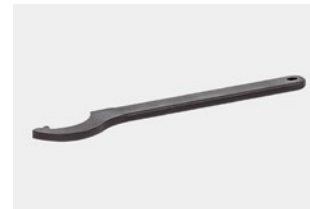
Hook wrench Item No. 9150006024