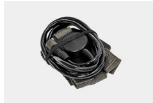
Headset VX1/VXT1 Item No. 2903170320