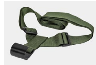
Carrying strap VX1 Item No. 8903170820