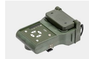
Control unit VX1 Item No. 2903170040