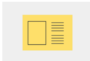
Backpack packing sketch VX1 Item No. 8903170890