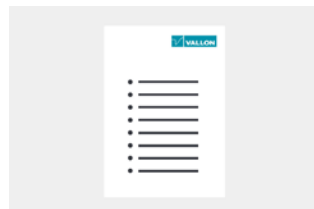
Operation manual VX1 Item No. 2903170330