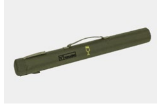
Transport bag for digital probe VSM Item No. 2903170450