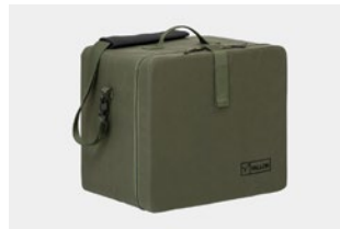
Carrying bag VX1 cable drum Item No. 2903170400