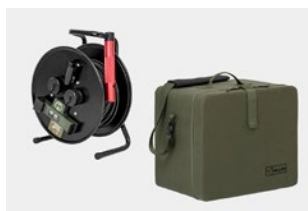
Cable drum VX1 SEPOS®, 15/12 m (completely) Item No. 2903170460