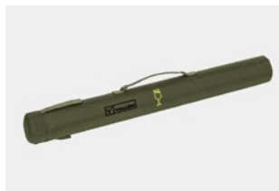
Transport bag for digital probe VSM Item No. 2903170450