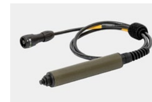
Hand switch start/stop VX1 Item No. 2503170160