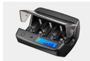
External battery charger 100-240V/50-60Hz, 12V Item No. 5900001010