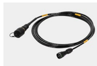
Connection cable SEPOS®-Borehole (VX1) Item No. 2503170040