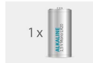
Alkaline battery 1.5 V Mono LR20 Item No. 5910001006