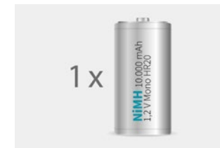
Rechargeable battery NiMH 1,2 V Mono HR20/10.000 mAh Item No. 5920001006