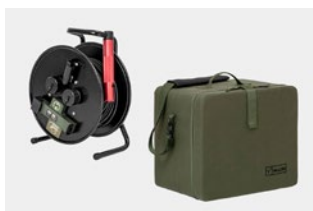
Cable drum VX1, 25 m (completely) Item No. 2903170240