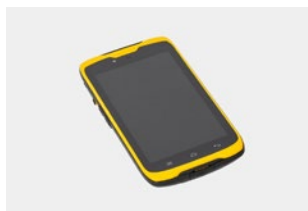
VFC4 - Small Field Computer for EVA4mobile® Item No. 2005350000