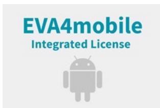
EVA4mobile® - Integrated license in combination with field computer VFC4 Item No. 2405350010