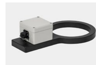
Detector SEPOS®-Borehole Item No. 2900130130