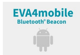
EVA4mobile® - Bluetooth® Beacon for temporary license activation Item No. 2009080000