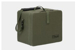
Carrying bag VX1 cable drum Item No. 2903170400