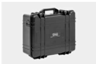
Case electronics set VXB2 Item No. 2802590002