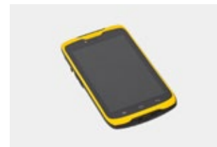
VFC4 – Small Field Computer for EVA4mobile® Art.-Nr. 2005350000