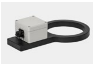
Detector SEPOS®-Borehole Item No. 2900130130