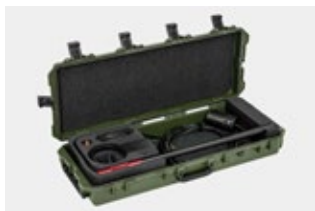
Sensor set VXB2 Item No. 2902590001