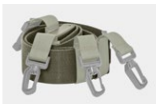
Waist belt Item No. 9150006007