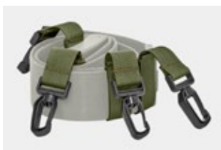
Carabiner for belt Item No. 8902590005