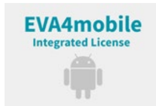
EVA4mobile® – Integrated license in combination with field computer VFC4 Item No. 2405350010