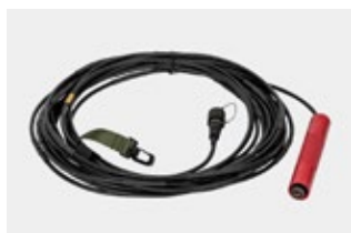
Sensor cable VXB2 SEPOS®, 15 m/12 m Item No. 2502590001