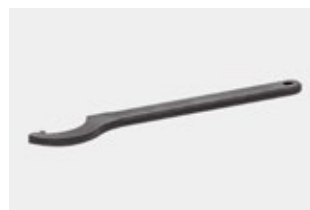
Hook wrench Item No. 9150006024