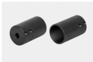
Borehole Shaft Guard Item No. 2900130170