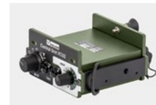
Central electronics unit VCU2 Item No. 2002540110