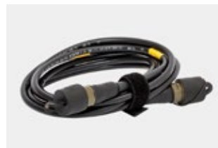
Connection cable SEPOS®-Borehole (VCU) Item No. 2500130032