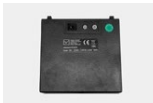
Battery VXB2/VXB3plus Item No. 2902540104