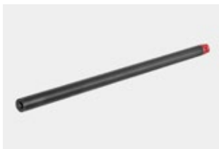
Digital probe VSM Item No. 2909990674