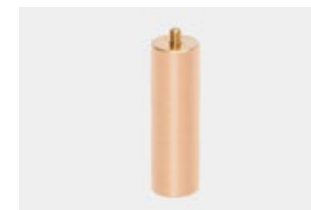
Extra weight Item No. 2909990631