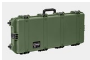
Case sensor set VXB2 Item No. 2802590001