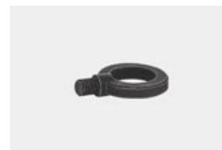
Ring screw Item No. 2909990105