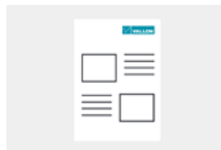
Operation manual VFC4 Item No. 8905350000