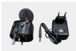
Kit Battery charger Item No. 2902540110