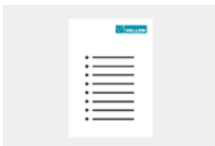
Operation manual VCU2 Item No. 8902540103