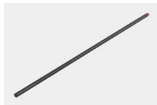
Digital probe VSL Item No. 2909990675