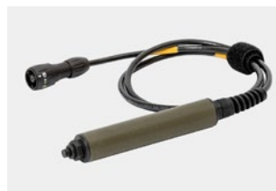
Hand switch start/stop VXT1 Item No. 2503170160