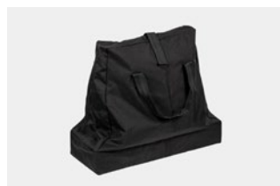
Transport bag for probe carrier VXT1 Item No. 2802240001