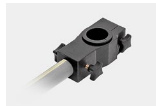
Mounting clip for probe VXT1 Item No. 2902240006