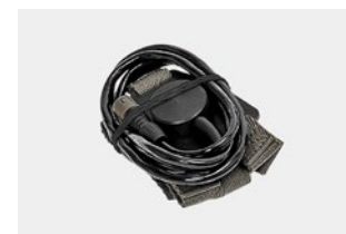
Headset VX1/VXT1 Item No. 2903170320