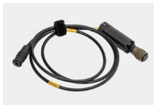
Connection cable probe VXT1 Item No. 2504140000