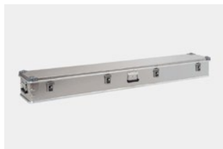
Case VXT1 Item No. 2804140000