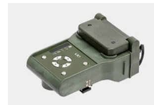
Control unit VX1 Item No. 2903170040