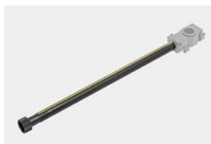
Carrying bar front VXT1 Item No. 2102230006