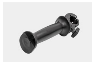
Handle VXT1 Item No. 2902230029