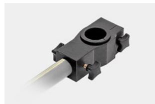
Mounting clip for probe VXT1 Item No. 2902240006