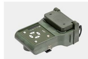
Control unit VX1 Item No. 2903170040