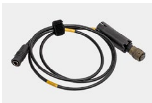
Connection cable probe VXT1 Item No. 2504140000