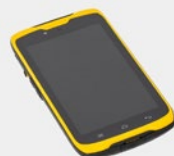
VFC4 - Small Field Computer for EVA4mobile® Item No. 2005350000