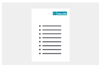
Operation manual VXT1 Item No. 2904140000