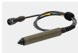
Hand switch start/stop VXT1 Item No. 2503170160