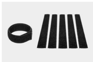
Velcro fastening tape VXT1 6 x 15 cm Item No. 29E4140000