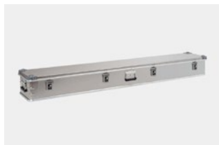
Case VXT1 Item No. 2804140000