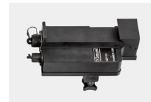
Docking Station VXT1 Item No. 2904140010