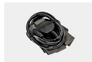
Headset VX1/VXT1 Item No. 2903170320