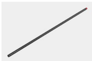
Digital probe VSL Item No. 2909990675