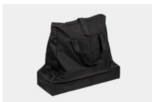
Transport bag for probe carrier VXT1 Item No. 2802240001