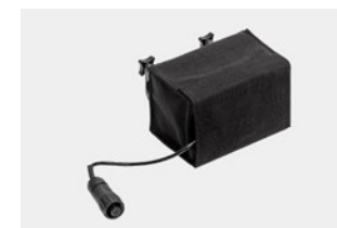
Set power supply Item No. 2902200218