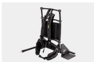
Probe carrier VXT1 Item No. 2904140001