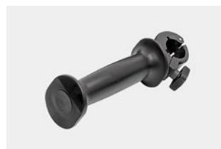
Handle VXT1 Item No. 2902230029