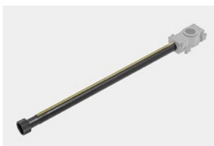
Carrying bar front VXT1 Item No. 2102230006