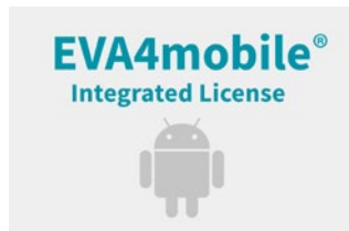
EVA4mobile® - Integrated license in combination with field computer VFC4.1 Item No. 2405350010