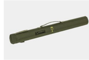
Transport bag for digital probe VSM4 Item No. 2903170450