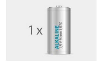
Alkaline battery 1.5 V Mono LR20 Item No. 5910001006