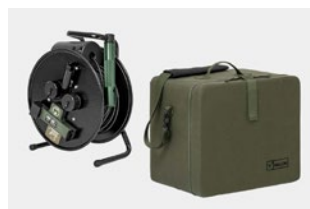
Cable drum VX1 SEPOS®, 15/12 m (completely) Item No. 2903170460