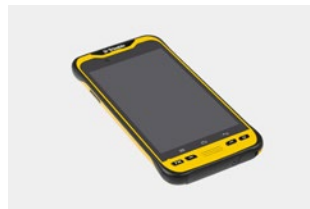
VFC4 - Small Field Computer for EVA4mobile® Item No. 2005350001