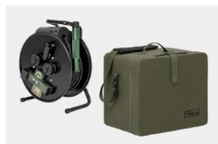
Cable drum VX1, 25 m (completely) Item No. 2903170240