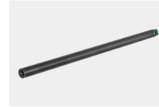
Digital probe VSM4 Item No. 2005320010