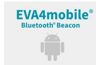
EVA4mobile® - Bluetooth® Beacon for temporary license activation Item No. 2009080000