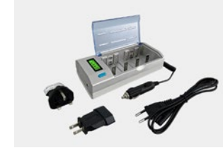
External battery charger 100-240V/50-60Hz, 12V Item No. 2909990847