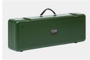
Case VX1 Item No. 2903170410