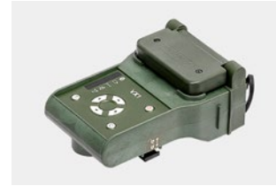
Control unit VX1 Item No. 2903170040